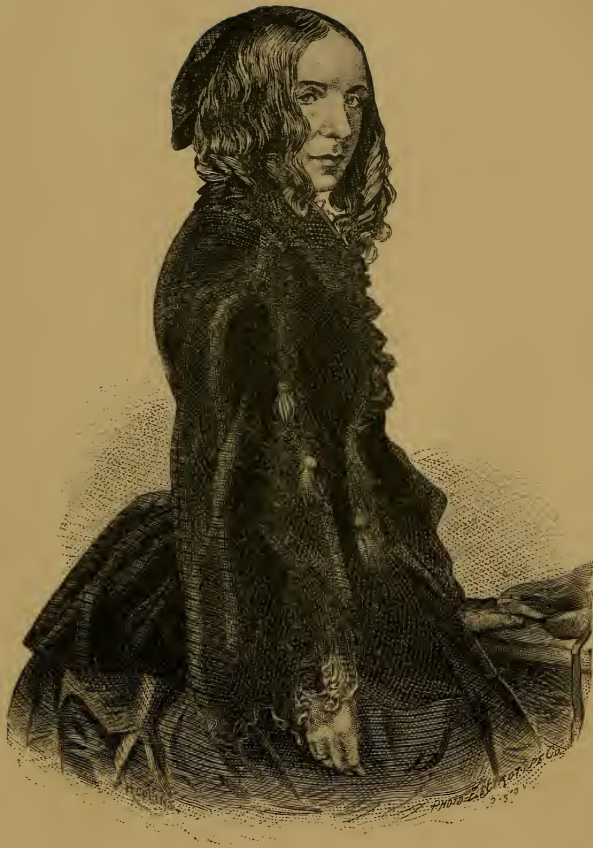
Elizabeth Barrett Browning Rome. February. 1859.